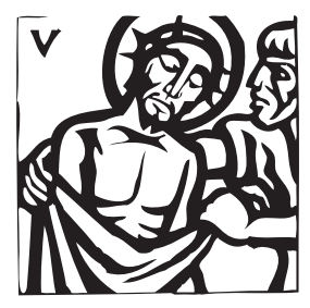
JESUS IS STRIPPED OF HIS GARMENTS