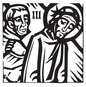
SIMON OF CYRENE HELPS JESUS CARRY THE CROSS