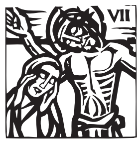
JESUS DIES ON THE CROSS